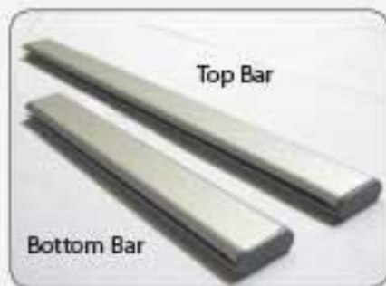
2 Bars for Side Graphic